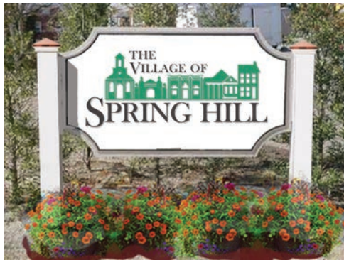
Drawing for illustration only. Does not reflect final design.

When The Village of Spring Hill, Inc., was approached this summer about revamping the area at Old Shell Road and I-65, we saw the perfect opportunity to create an attractive entrance into our Village. Through a collaborative effort, a design was created and a plan was formulated. Keep Mobile Beautiful will supply 25 Nellie Stevens Holly trees to be planted along the chain link fence adjacent to the interstate. Alabama Department of Transportation (ALDOT) will fund the concrete and TVSH pavers to fill the medians. TVSH will pay for the labor to install the landscaping as well as a Village sign. Through the efforts of Gina Gregory , an agreement was reached with the City for the Mobile Parks and Recreation Department to maintain the area. "Together We Can!"