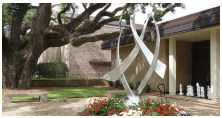
The Flame of Knowledge Moorer Branch Mobile Public Library in Spring Hill commissioned by The Village of Spring Hill, Inc. in 2012.

Public art gives communities a sense of identity making them more memorable. This is becoming more important in a world where every place tends to look the same! The Village of Spring Hill, Inc. plans to expand on our initiative to place more public art in the Village making our community a more unique place to live!