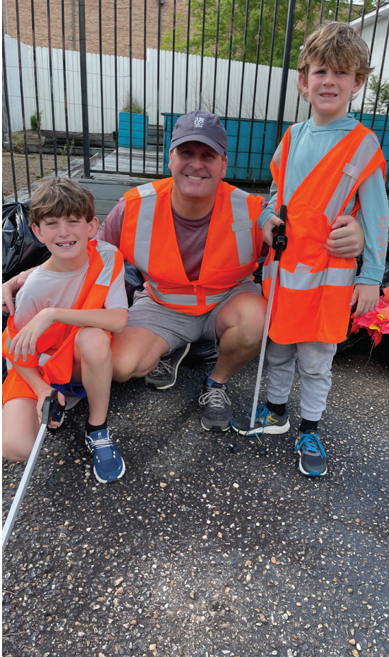
The Village Cleanup held March 25th was a success thanks to all our volunteers!

THE VILLAGE OF SPRING HILL™ 4358-B Old Shell Rd. #145 Mobile, AL 36608