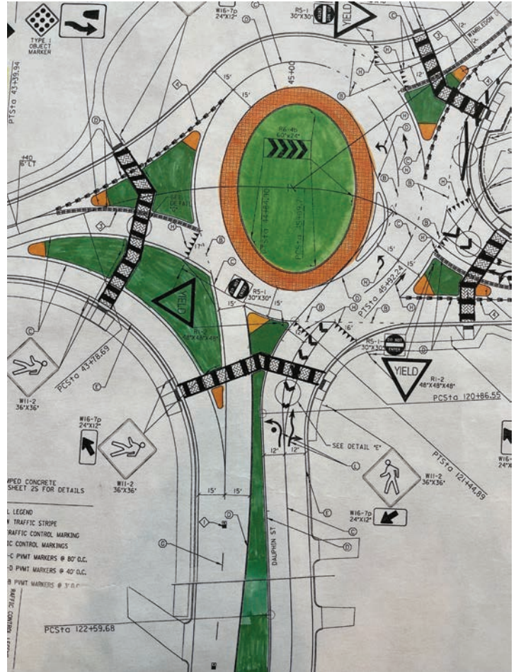
Rendering of City of Mobile plan for the roundabout and crosswalks at the intersection of Dauphin St. and S. McGregor Ave. This is a portion of the entire project that extends down to Airport Blvd.

All these suggested changes are being considered by the administration.